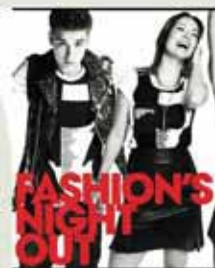
Fashion Night Out Vancouver