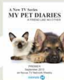
My Pet Diaries