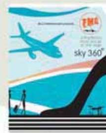
FMA Concert Gala