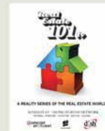
Real Estate 101