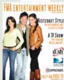
FMA Entertainment Weekly